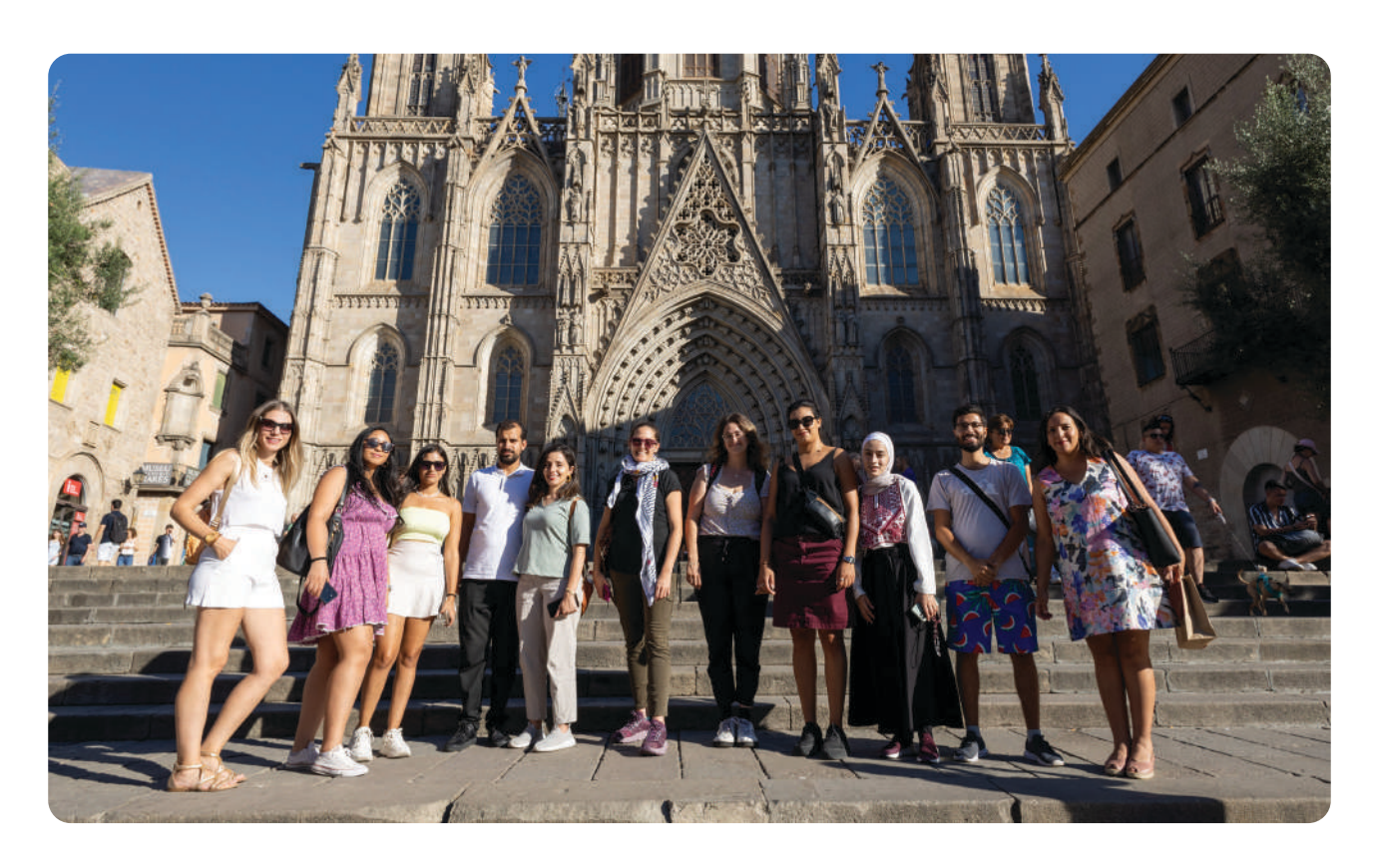
The group then dined at the restaurant Al Jaim a De Abou Khalil in the centre of Barcelona.

El Born's colourful streets, galleries, and boutiques stimulate fresh ideas, while its architectural wonders, like Santa Maria del Mar church and Picasso Museum, provide cultural context. The entrepreneurs had a tour of Barcelona's historic old town while visiting the area's artisanal workshops and boutiques. These showcased Barcelona's traditional craftsmanship, sparking innovative design concepts. Moreover, the neighbourhood's dynamic atmosphere attracts fellow creatives, fostering potential collaborations and networking.